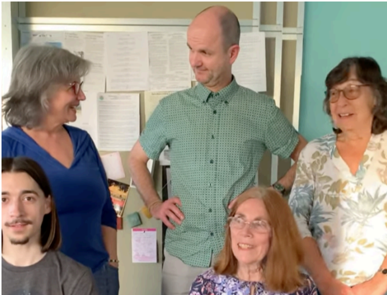
The Solidarity Singers meet every other Tuesday at 5:30 PM at WESPAC!