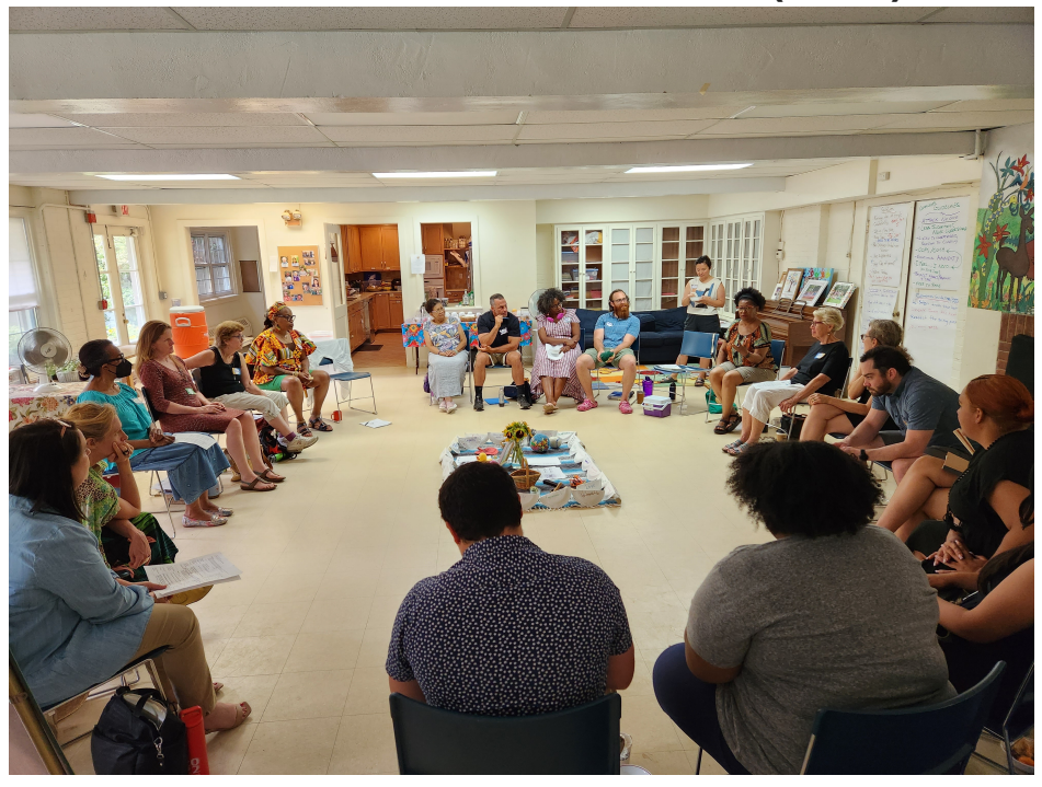
RJW and CLUSTER hosted our third Restorative Justice Circle Keeper