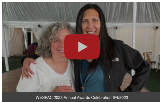
WESPAC 2023 Annual Awards Celebration 6/4/2023

We need our movements for progressive social change more than ever as we face various transnational crises. To help keep us going, here is a snippet from our recent annual awards: