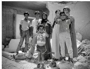
Palestinian Family in their demolished home.

For Palestinians, the claim of Israeli democracy has been a cruel hoax. Israel is a place where Palestinian homes are destroyed on the whim of Israeli officials, Palestinian land is seized by gun-toting settlers with the active support of the army and police, Palestinians are jailed and killed with impunity virtually daily, and Israeli law explicitly states that Israel belongs to Jews and not to Palestinians. It is a place, according to Human Rights Watch, of "apartheid and persecution" involving "an institutionalized regime of systematic oppression and domination".